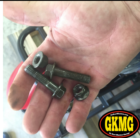
11. Locate the two larger bolts and nuts for the rear shocks.