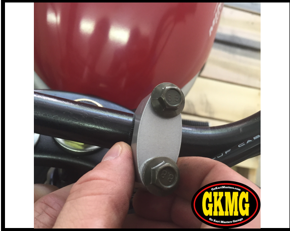
17. Place both clamps over handlebar & start the bolts into the threads.