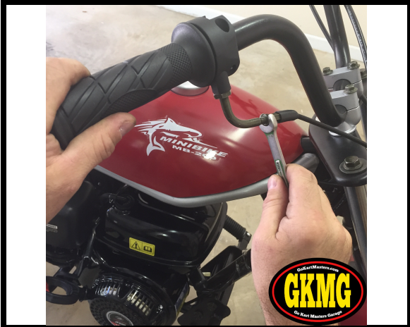
49. Check and adjust throttle free play. Should have 1/8"-1/4" of free play. Secure adjuster nut.