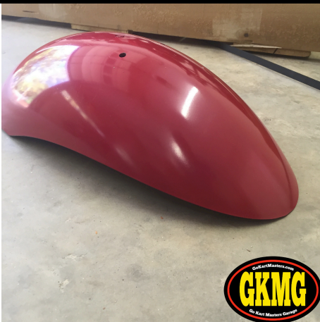
9. Front fender.