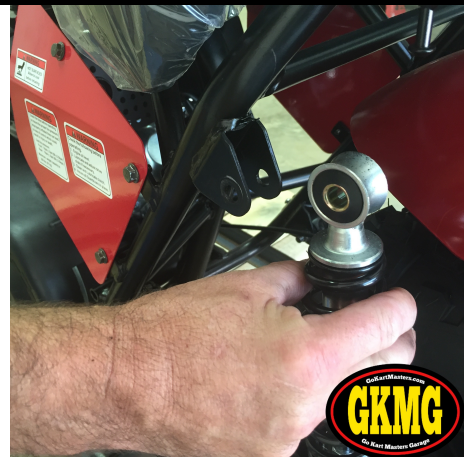
12. Lift up on the rear of the bike and align top of shock with mount. *NOTE: Do Not Lift on Rear of Seat.