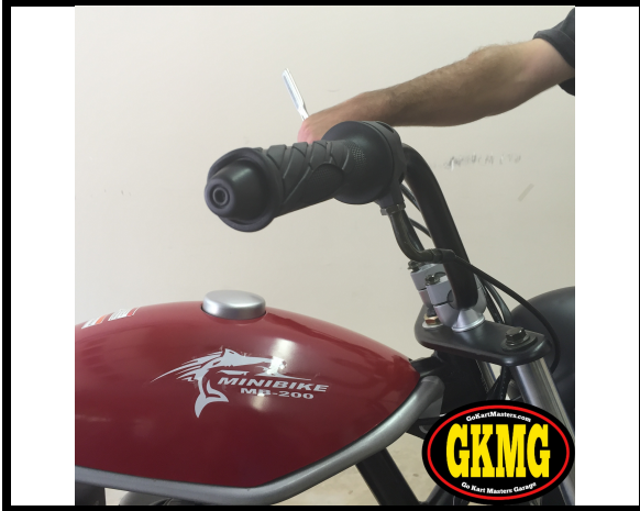
18. Tilt handlebar at the same angle as the front forks. *NOTE: Can be adjusted forward or back later.