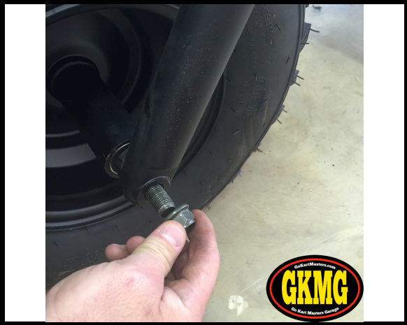
30. Install the front axle nut.