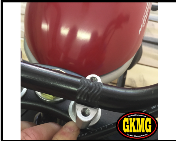
16. Place handlebar on bike with knuckle marks into clamps.