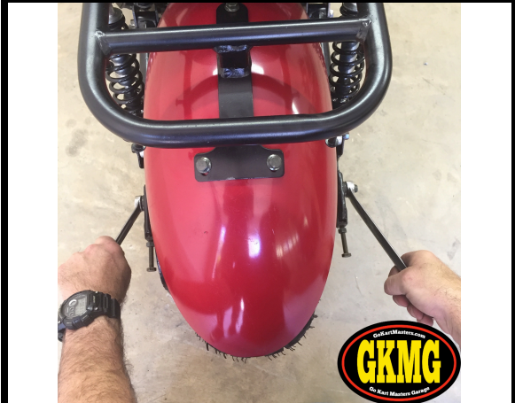
50. Check and tighten rear axle.