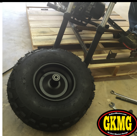
24. Remove front wheel from crate.