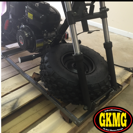
20. Now, it's time to install the front wheel.