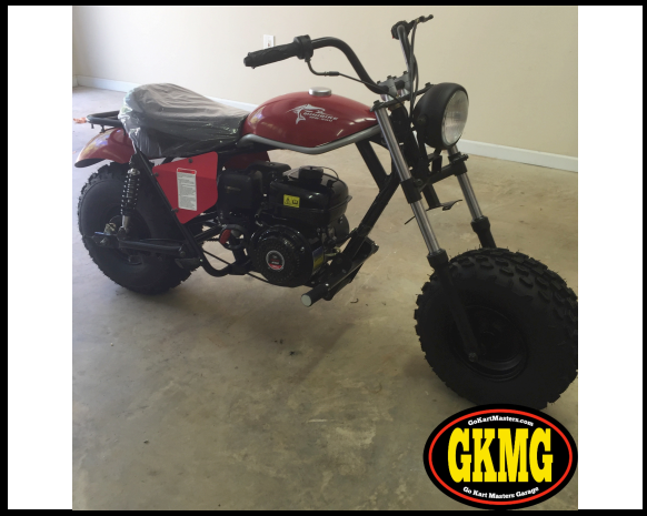
29. With the kickstand down and the bike standing up, it's time to finish up assembly.