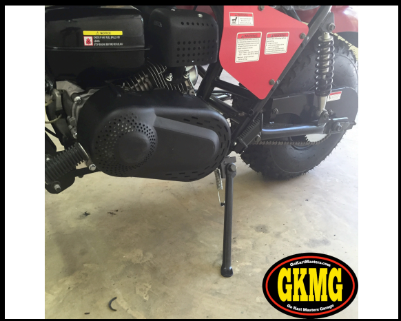
28. Stand the bike up and put the kickstand down.