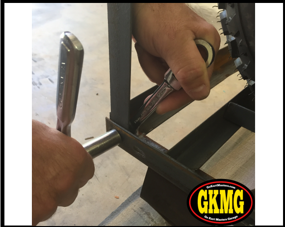
3. Remove crate bolts and nuts.