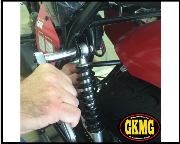
14. Tighten shock bolts & nut. Repeat on other side.