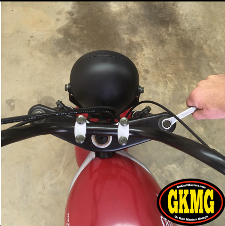
38. Check and tighten the front fork bolts.