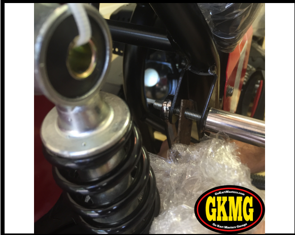
6. Remove bolt and nut from rear shock mounts & remove shipping rods on both sides.