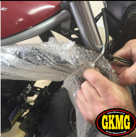
7. Cut zip tie holding handle bars and remove plastic.