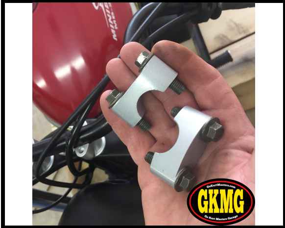
15. Locate the handlebar clamps with 4 bolts.