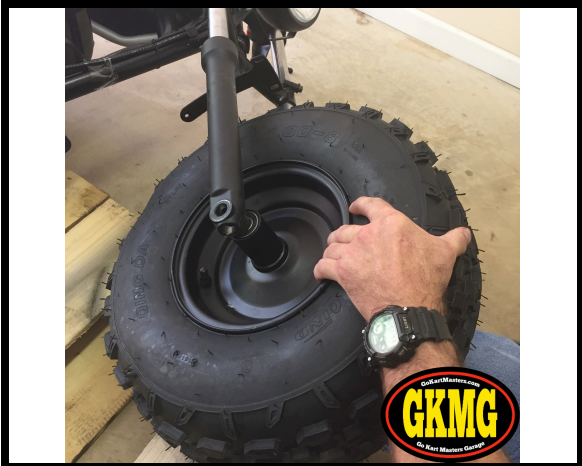
25. Gently lay the bike on its side. Be sure to protect the paint from scratches.