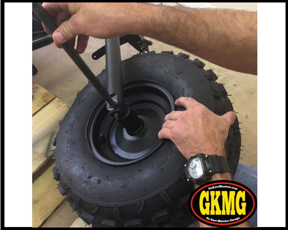
26. Place the wheel in the front forks with the valve stem on the right hand side (if sitting on the seat). Install axle.