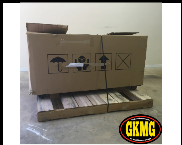
1. Unload the mini bike and inspect.