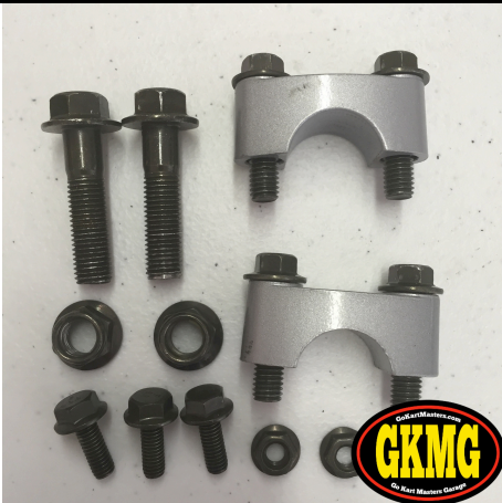
8. Hardware Bag includes 2 clamps with 4 bolts, (2) 10mm bolts & nuts, (3) 6mm bolts & nuts.