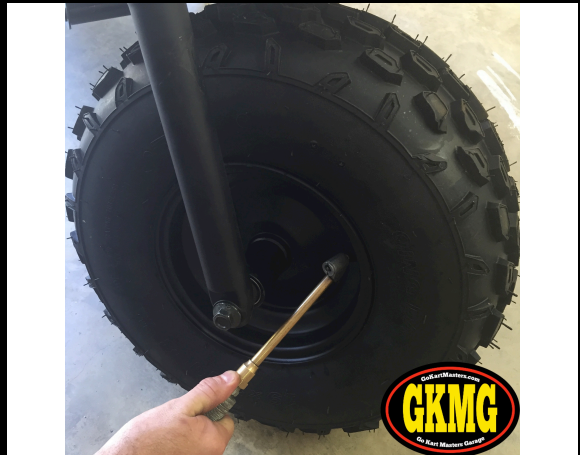
53. Inflate tires.