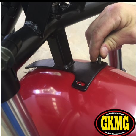
33. Install the front fender with 3 small bolts and nuts.