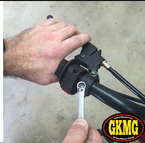
41. Use an 8mm wrench and tighten the brake lever.