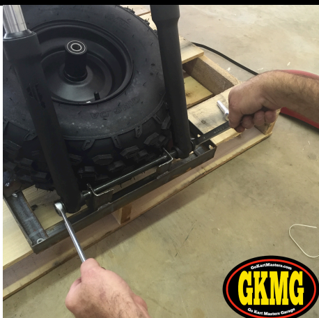
21. Remove front axle from forks.