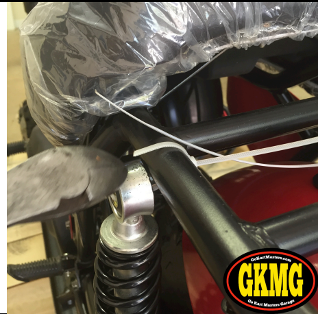
10. Cut zip ties on rear shocks.