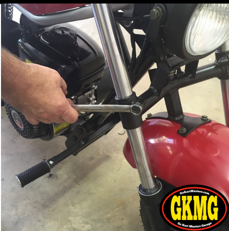
39. Check and tighten the fork clamps.