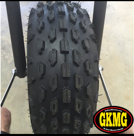
31. Tighten front axle and nut securely.