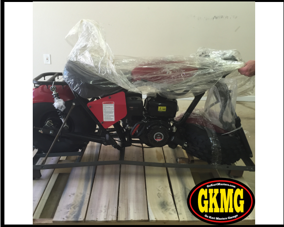
5. Remove plastic from mini bike.