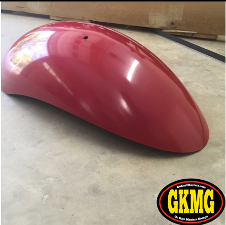
32. Now that the front wheel is secure, it's time to install the front fender.