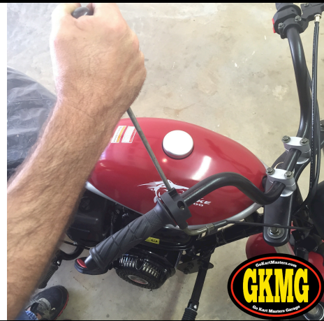
40. Use a Phillips head screwdriver and tighten the throttle grip.