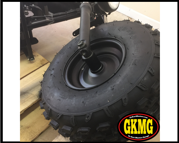
27. Push the axle all the way through the wheel and fork.