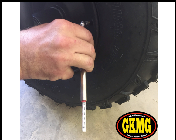
54. Gauge tires to 8 psi.