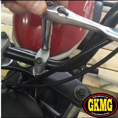
19. Tighten all 4 clamp bolts securely.