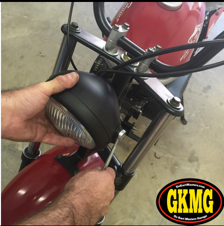
37. Check headlight bolts and tighten. May need to adjust later.