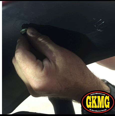
34. Install nuts on the bottom side of the fender.