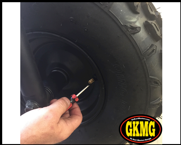
52. Tighten valve stems with valve stem tool.