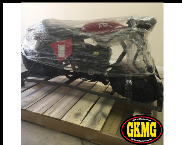
4. Remove top metal crate.