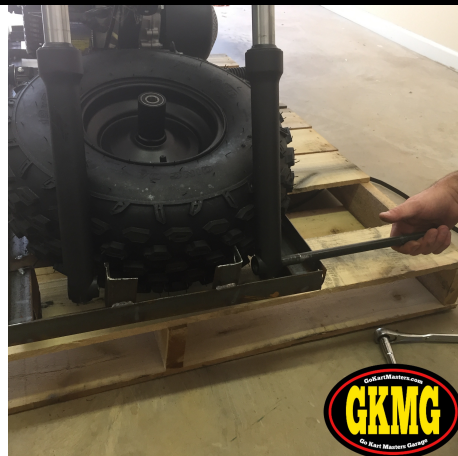
23. Slide front axle out.