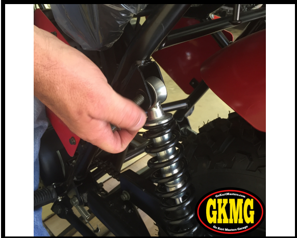
13. Insert bolt from the outside and push all the way through the mounted shock.