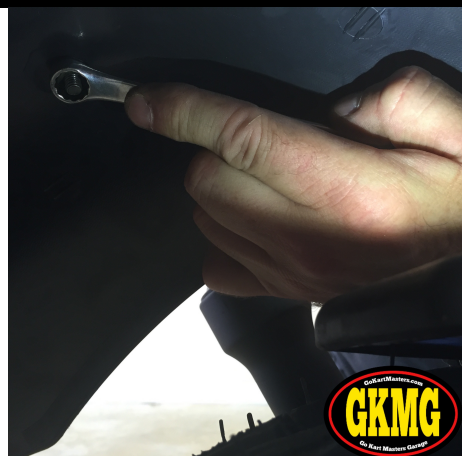
36. Use a wrench on the nuts underneath the fender.