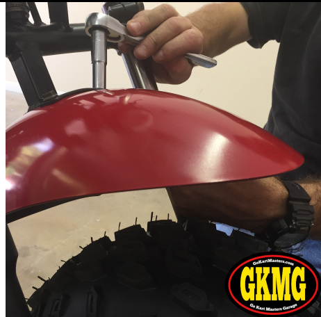
35. Tighten fender bolts with a socket or wrench.