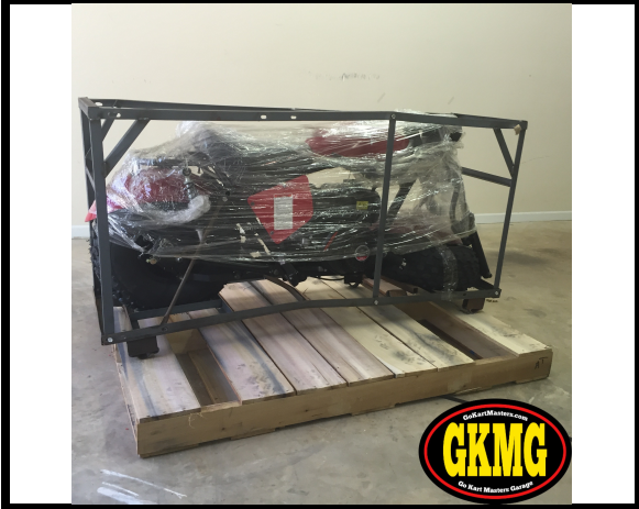
2. Remove outer cardboard.