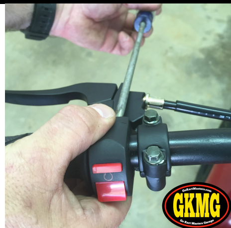
42. Use a Phillips screwdriver and tighten the switch. May need to rotate switch so that it's accessible w/ thumb & visible while driving.