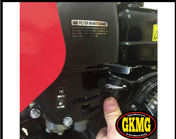
51. Turn fuel valve to 'ON' position...forward.